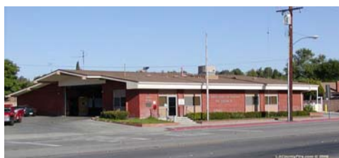
Los Angeles County FD Station 111

At press time, St. Francis Medical Center, Little Company of Mary Hospital-Torrance, and Henry Mayo Newhall are tied for the lead in enrollments with a total of 12 each. UCLA Westwood has received 11 patients, with Methodist Hospital of Southern California, Providence St. Joseph’s Medical Center, and Sherman Oaks Medical Center tied at